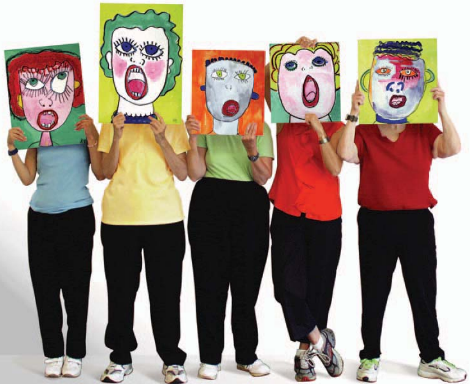
"I Am A Part of Art" invitation; Left: Event Photos.