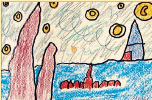
By Ellen Gerlich